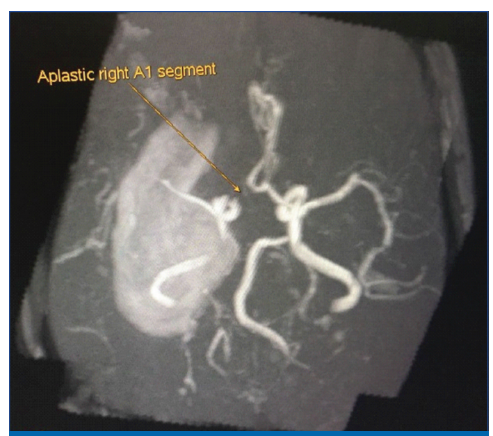
[Table/Fig-4]: Unilateral aplasia of Right Anterior Cerebral Artery (ACA) (A1 Segment).